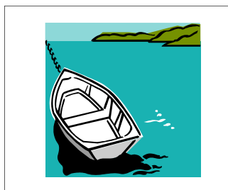
We float like vessels on the great tides of Wisdom

The symbol systems established in the school of Pythagoras and in the spiritualities of the Orphic and