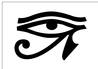
Symbols and myths are codes used to unlock the mystery of human destiny

coded Wisdom is to awaken the heart and move it towards its ultimate destiny, transformation through the alchemical processes of time and the